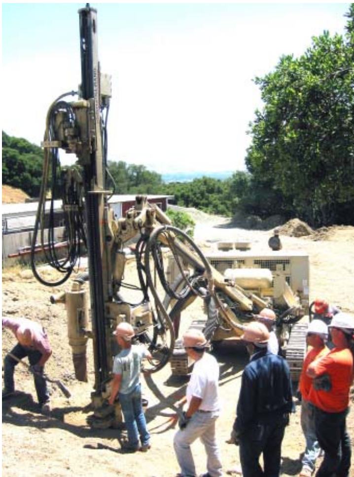
Trainees take turns to learn how to use an Air Track Drilling rig.

Hemstock jokes that an Air Track Drilling rig is "basically a large jackhammer on tracks," but he